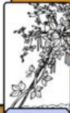
SELF POLLINATING FLOWERS