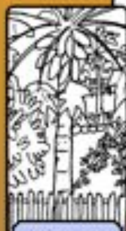
MALE & FEMALE PLANTS