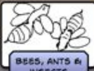
BEEES, ANTS & INSECTS